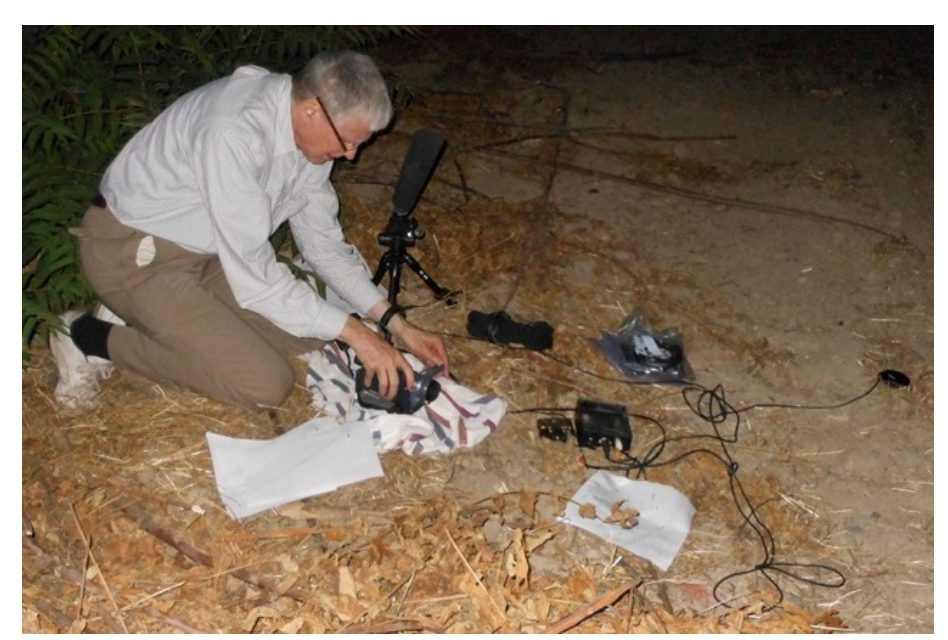
Setting up a "mighty mini" remote video station